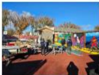
Garden Shed Being Built