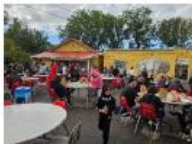
Back to School BBQ