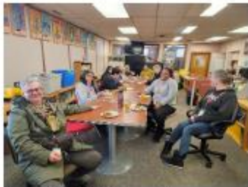
Lunch Break for Everyone!